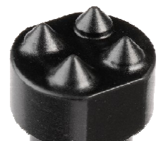
Tungsten carbide tipped bush hammer head

“SPECIAL FEATURE” : SINGLE SCABBLER IS LOW VIBRATION