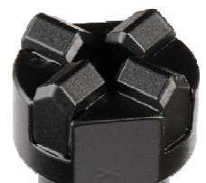
Tungsten carbide tipped cruciform head